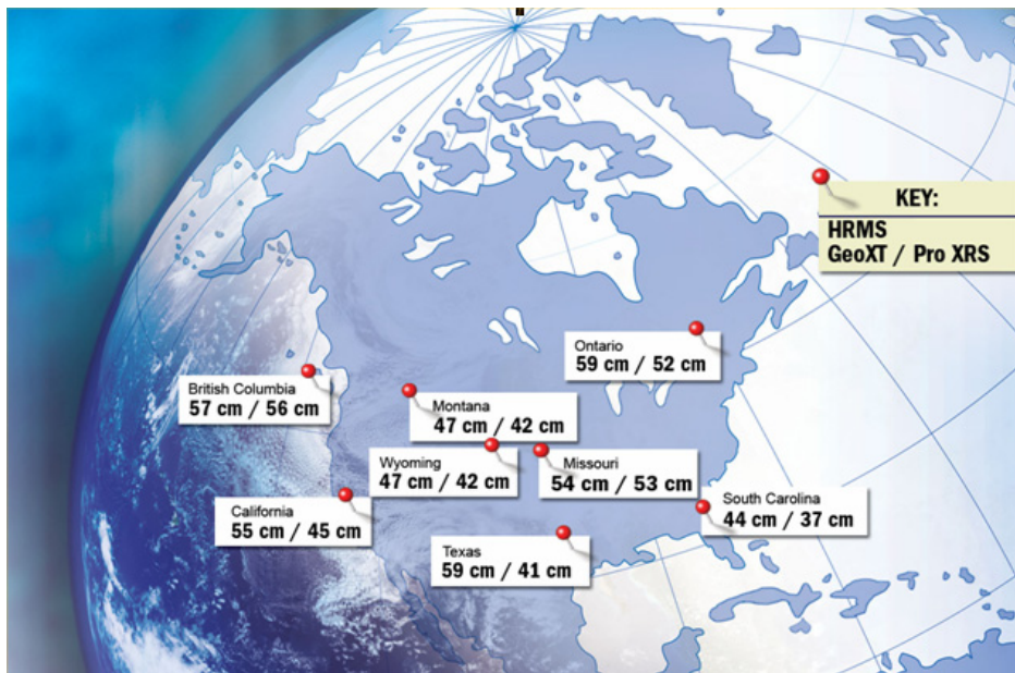
Figure 2: HRMS values for WAAS corrected GPS accuracy with Trimble GeoXT handhelds and GPS Pathfinder Pro XRS receivers

In each instance, the GPS Pathfinder Pro XRS showed greater accuracy than the GeoXT handheld, which is to be expected due to the additional receiver noise of the integrated (GeoXT) handheld and the larger antenna area of the Pro XRS.